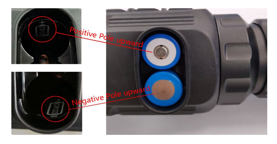
Fig.2 Battery installation