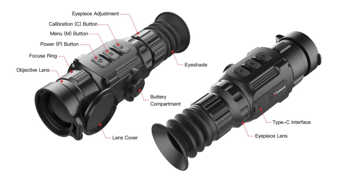
Fig.1 Parts info

The Saim series is a low-cost thermal rifle scope, which can be mounted on various firearms for night hunting and target observation. Its compact size and lightweight design make it easy to carry. What makes it outstanding is long operation hours, good concealment and great ability to detect, recognize and identify objects or targets fast and easy. The Saim series effective at close and long ranges irrespective of light and harsh weather conditions, that is, in total darkness, through heavy smoke, haze, fog, and dust.