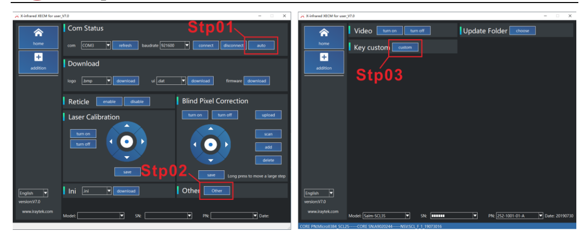
Fig.7 Operation procedure