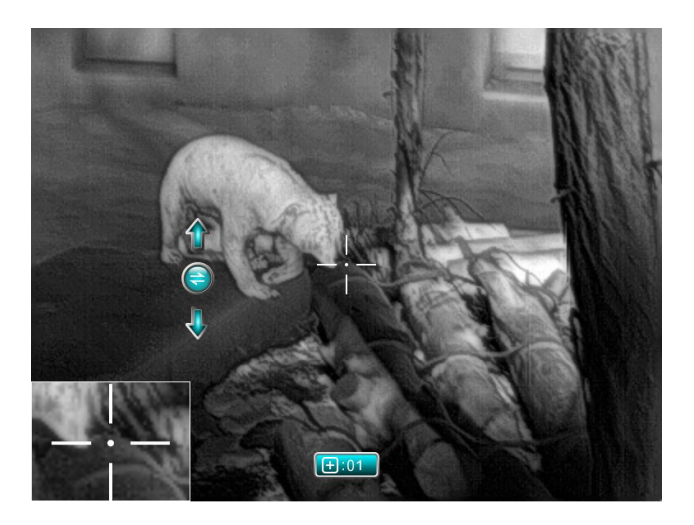
Fig.5 Blind pixel calibration interface