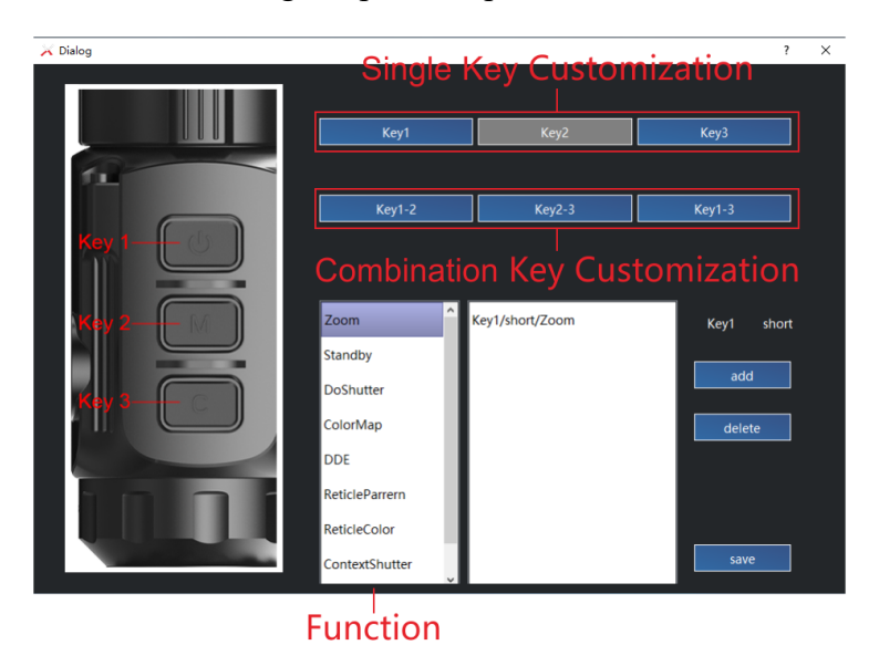
Fig.8 key function customization interface