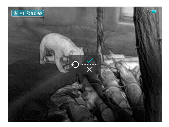
Fig.6 Default resetting interface